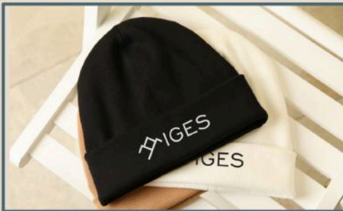
Win daily at the Swag Station