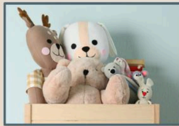
Toy + On Trend