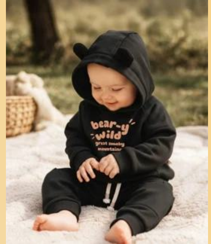
Style # 1460: Angel Fleece Infant Bear Ear Hoodie and Jogger Set in Black

With that in mind, we're excited to introduce you to our children's brand, Moose + Goose. Built on 30 years of manufacturing experience, Moose + Goose brings a playful, adventure-driven spirit to kids' apparel while maintaining the premium feel and reliability you expect from Valani. The line blends imaginative design with destination-ready quality, giving families pieces that feel joyful, memorable, and worth taking home. Together, Valani and Moose + Goose offer a cohesive, high-value assortment designed to elevate your retail experience and connect with guests of every age.