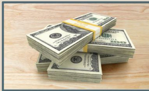
Enter daily to win a cash prize!