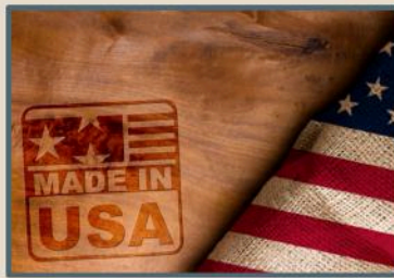
Made in America