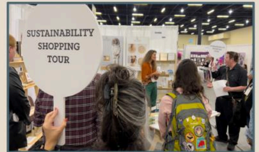
On-Site Shopping Tours at both locations